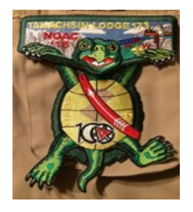
Takachsin Lodge 2015 NOAC Turtle Patch