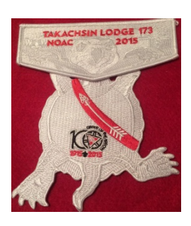
Takachsin Lodge 2015 NOAC White Ghost Turtle